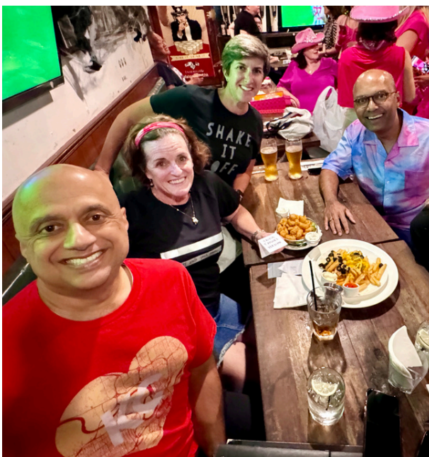
Pub Quiz for a good cause.