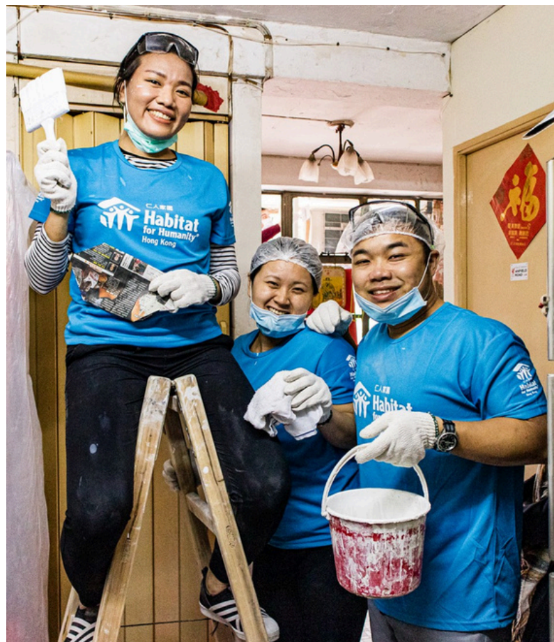
2024 grantee, Habitat for Humanity's work to improve the living conditions for people in need living in public housing

Though volunteer initiatives are operated through the AWA, the community service and outreach team work closely with the AWAF to provide greater alignment with the foundation's grantees.