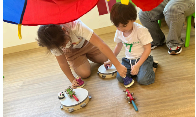
Music Therapy at The Child Development Centre

In the fall of 2024, we had the opportunity to review the final reports from our 2022-2023 class of grantees. 14 organizations reported on the impact of $845K in funds awarded. Below are just a few of the ways in which AWA grants helped to make a difference in the community.