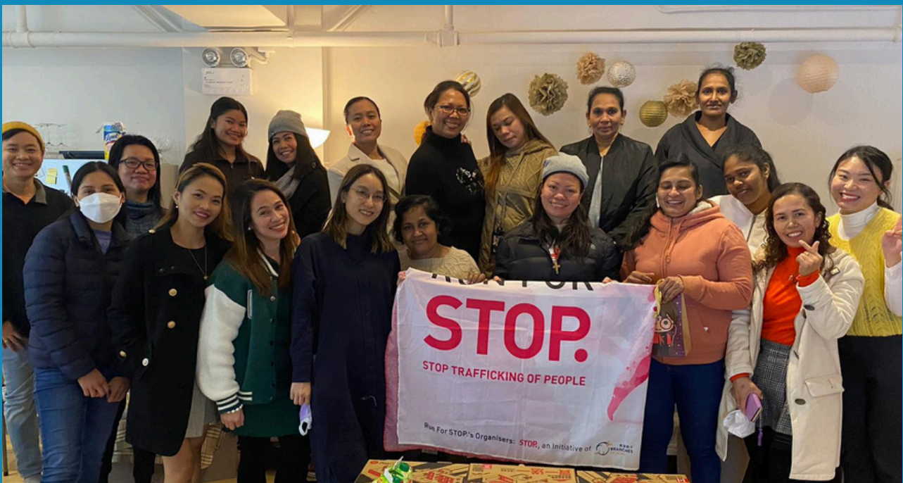
Branches of Hope's STOP (Stop Trafficking of People) program.