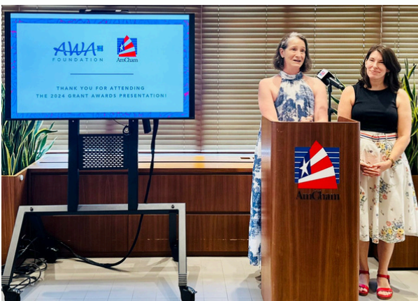
2024 Grant Awards Presentation

At the June 2024 Awards Presentation, generously hosted by the American Chamber of Commerce, $1.1M was distributed in AWAF funding to 16 Hong Kong charities and $240K to four charities on behalf of the American Chamber of Commerce Foundation.