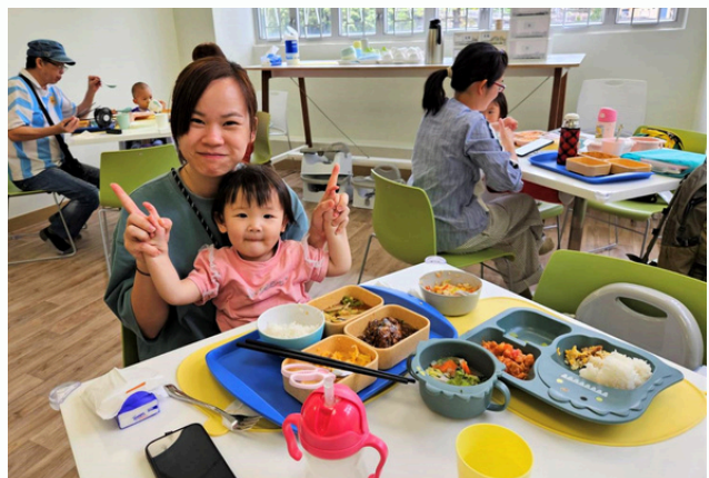
2024 Grantee, One Sky Foundation's Healthy Meals program