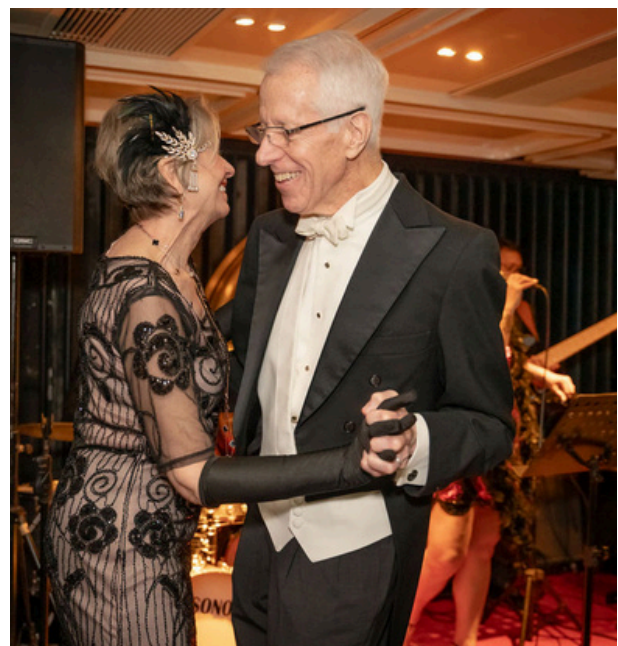
Dancing the night away at the Gatsby Gala.