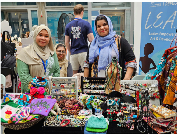
Centre for Refugees table at the Thanksgiving Festival

Together, these campaigns enabled us to provide grants of HKD 50,000 each to five charities. They exemplify the power of community-driven philanthropy, where joy, art, and generosity converge to create lasting change. We extend heartfelt thanks to every donor, volunteer, and participant who took part in this year’s fundraising efforts.