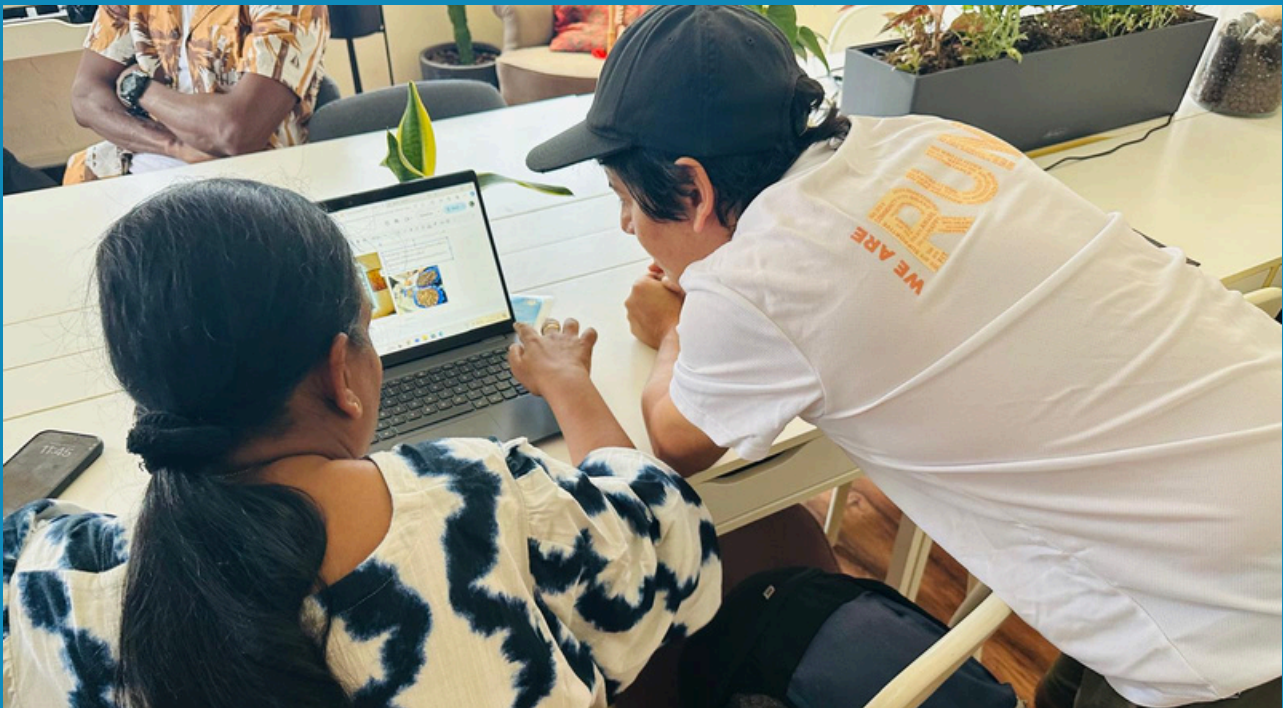
2025 grantee, RUN Hong Kong's computer and IT skills development program