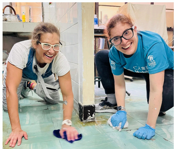
AWA volunteers at a Habitat for Humanity Hong Kong project

Through these initiatives, members contributed time and talent to causes spanning education, refugee support, environmental sustainability, housing, and community care. The expanded scope of CSO reflects our commitment to making volunteering accessible, impactful, and inclusive to ensure that every member has the opportunity to give back to the community.