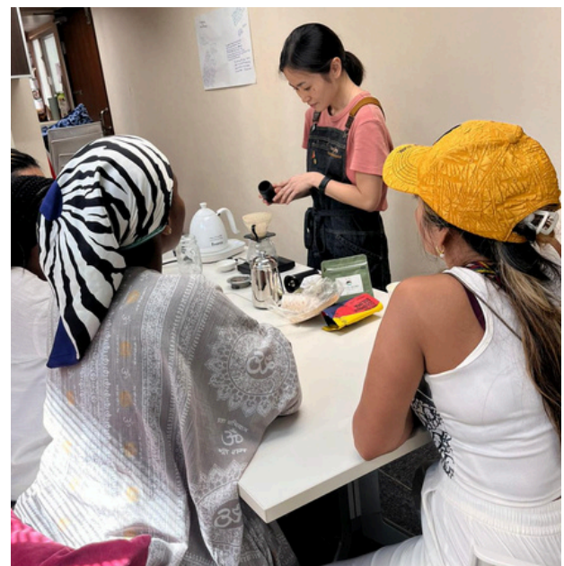
2024 grantee Sons & Daughters' skills development class