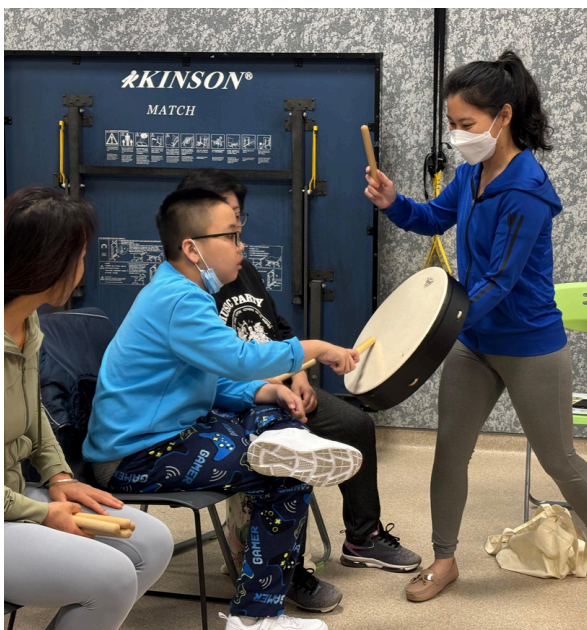
2024 grantee Love 21's music therapy class

* Please note that HKD2M of the AWA's assets are classified as restricted. These funds are designated exclusively for emergency use and cannot be applied to general operations or discretionary spending to ensure that resources remain available to respond swiftly and effectively to unforeseen circumstances, safeguarding both our mission and the communities we serve.