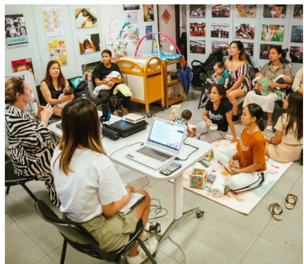
2025 grantee, PathFinders' mothers and babies group

At the June 2025 Awards Presentation, generously hosted by the American Chamber of Commerce, the AWA Foundation awarded HK$250,000 in funding to five local charities: Branches of Hope, Habitat for Humanity Hong Kong, PathFinders, RUN Hong Kong, and Saint Barnabas' Society & Home. These grants mark the beginning of our new two-year cycle, integrating financial support with hands-on service opportunities to strengthen partnerships, provide greater stability, and enhance visibility and engagement for our members with the causes we champion.