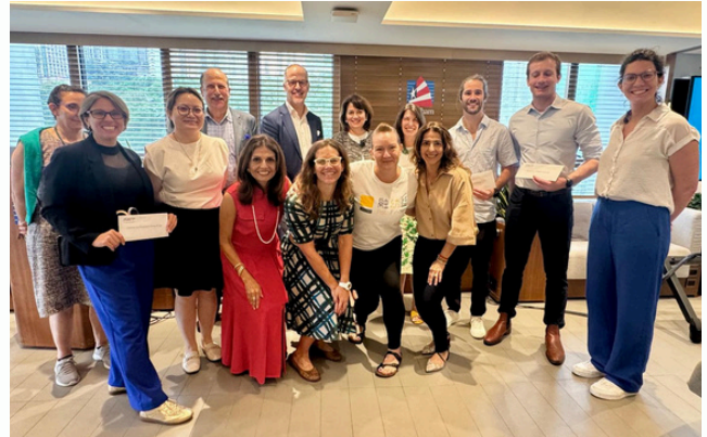
AWAF grantees at the 2025 Grant Awards Presentation

In the fall of 2025, we had the opportunity to review the final reports from our 2023-2024 class of grantees. 16 organizations reported on the impact of HK $1.1M in funds awarded. Below are just a few of the ways in which AWA grants helped to make a difference in the community.